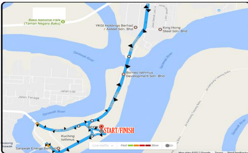
10KM Men & Women's Open / Veteran Men & Women Route